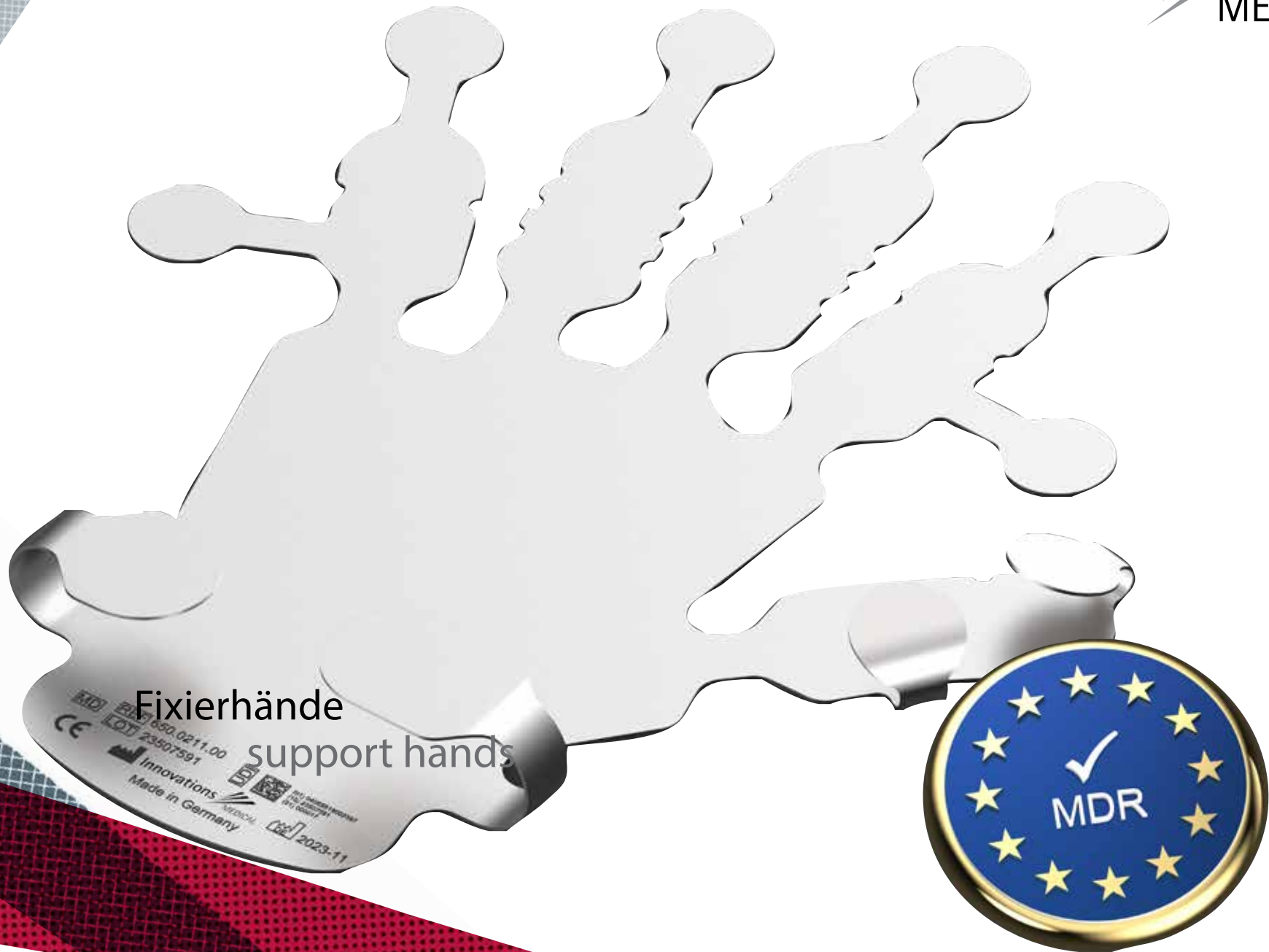
Fixierhände support hands